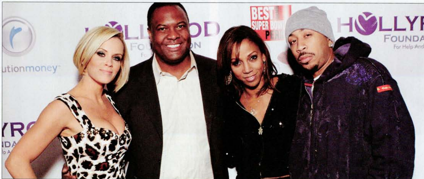
LUDACRIS AT HOLLYROD FOUNDATION EVENT: The HollyRod Foundation hosted a series of star-studded benefit events that included its signature Gridiron Glamour celebrity fashion show and brunch. The foundation was founded by actress Holly Robinson Peete and former NFL quarterback and Best Damn Sports Show Period co-host Rodney Peete. The brunch recently celebrated its 10th year. Pictured (L-R): Jenny McCarthy, Rodney & Holly Peete and Ludacris.